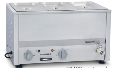
BM2B pictured. (wide footprint)