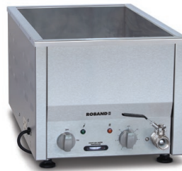
BM21 pictured. (narrow footprint)